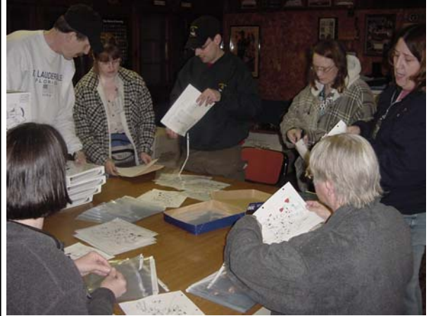
Your GREAT staff getting ready in the wee hours of the morning.

The Quartermaster Staff preparing another fantastic meal.